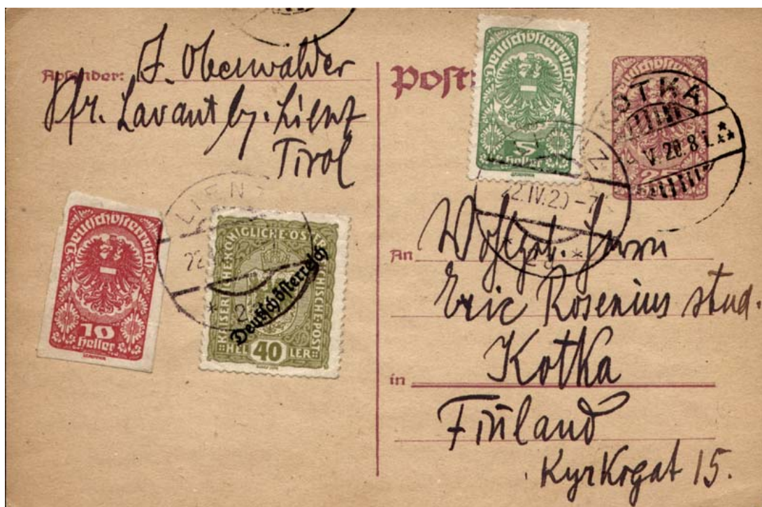
A similar mixture uprating a postcard to Finland.