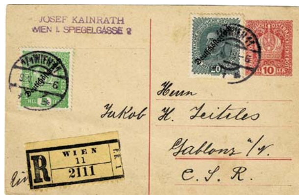
Deutschösterreich overprints uprating a KK postcard to Czechoslovakia.