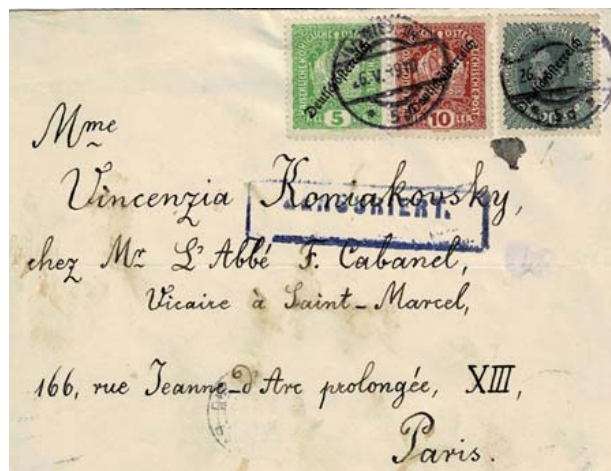
Three Deutschösterreich overprints on a letter from Vienna to Paris. Cancelled 6 May 1919; Paris arrival on back for 4 June. Censored.