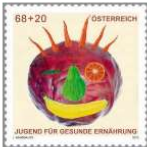
Jugend für gesunde Ernährung (youth for healthy nutrition); 68c + 20c; 3.6.2015; 200,000; offset; design: Jakob Hansbauer; grafik: Dieter Kraus; printed by ÖSD.