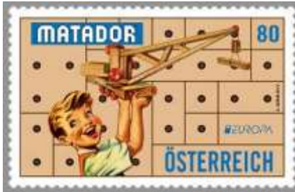
Europa 2015 – old toys – Matador. 80c; 7.5.2015; 300,000; offset; design: Gustav Assem; printed by ÖSD.