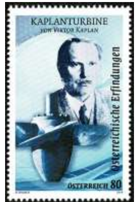
Kaplan-Turbine - Viktor Kaplan in the series Austrian Inventors. 80c; 30.03.2019; 350,000 in minisheets of 10;